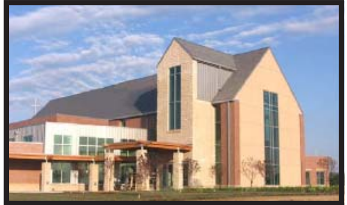
Phase I of the West campus of Lutheran Church of the Master in Omaha, Nebraska..

To get to that point the past two years have been a flurry of activity. They worked together to set a vision for what their dual-site ministry will look like. The congregation embarked on a major funding plan, determined staffing needs and operating budgets, and organized to make choices for the