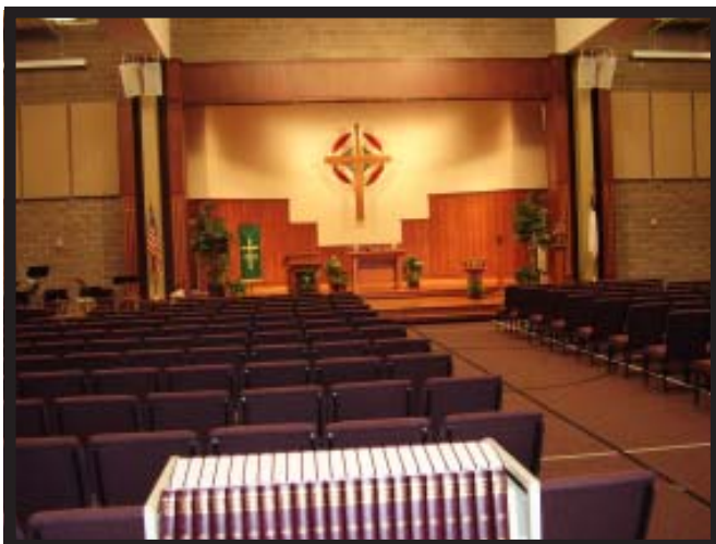
The new family life center on the West campus of LCM.

The people of LCM are just beginning to realize their dream of a dual site ministry with great hope for what they are doing so that “a people not yet created may praise the Lord.”